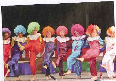
While the clowns put smiles on all faces.