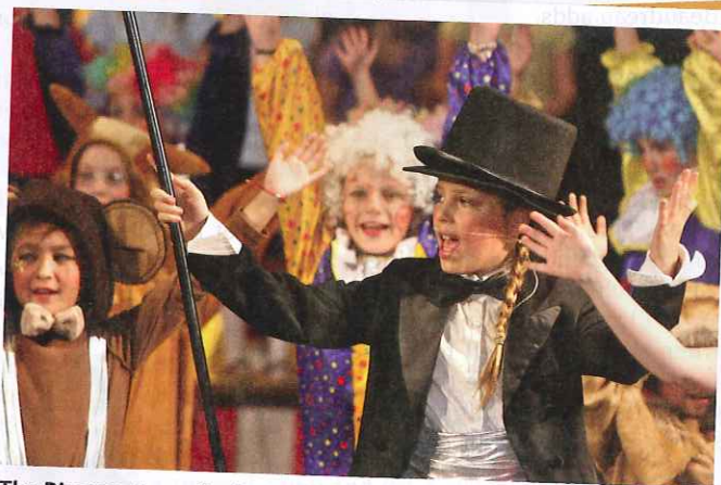
The Ringmaster calls the show a great success.

Afelzius. ¥1,750 for four sessions. 9am Special Education Consulting, Shanghai 5206-6273, www.specialedchina.com