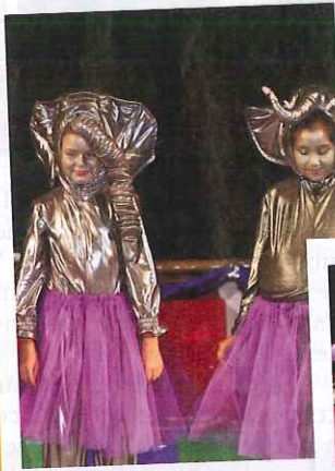
The two elephant sisters do their dance.