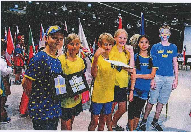
Students from three divisions of SCIS Pudong join the Parade of Nations on United Nation International Day of Peace.

SEPTEMBER 21 is the United Nations International Day of Peace. This year the theme is "The sustainable development goals: building blocks for peace."