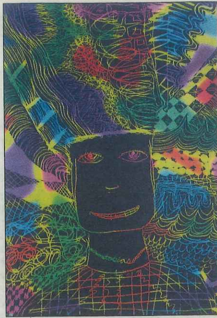
▲ "Crazy Hair Day" by Tobias Birtner, Grade 5