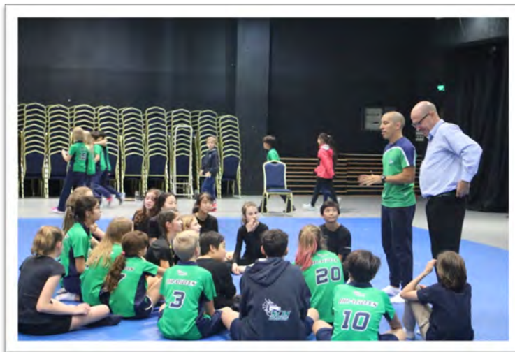
Grade 7 and 8 students prepare for their acrobatics performance for the Lower School