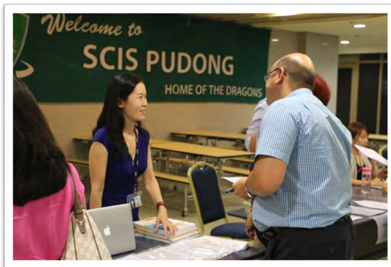
Back to school night