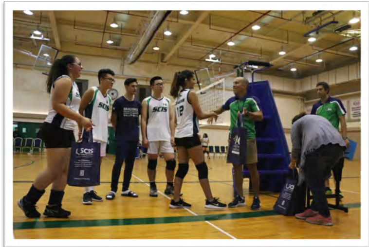
Coaches congratulate the seniors Monday night between games.