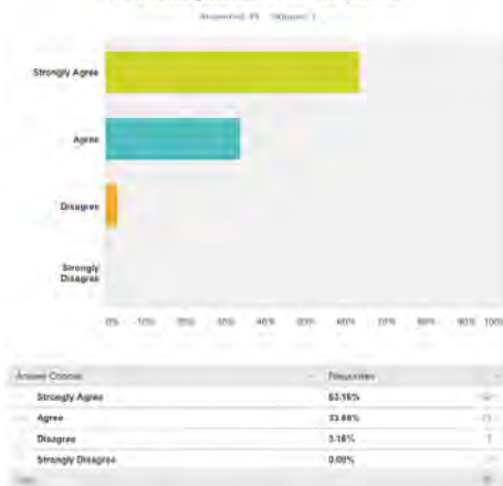
The conference provided me with a greater sense of my child as a learner, as well as their strengths and areas for growth.