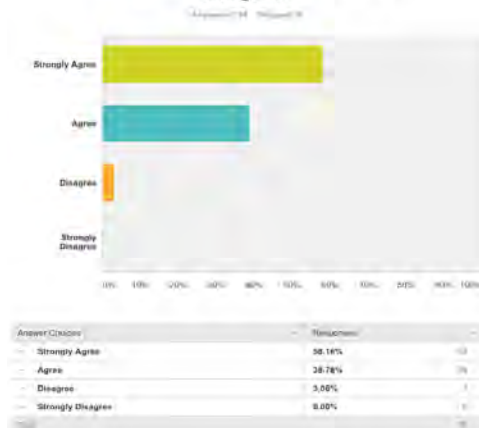
The conference provided me with opportunities to better understand how I am able to support my child with achieving their goals.