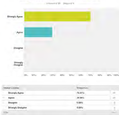
My child was prepared and interested in taking part in their student-led conference.